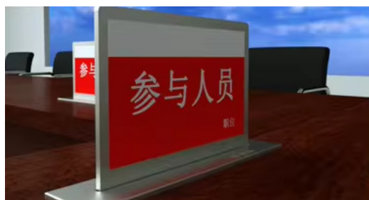
DOUBLE-SIDED HIGH-DEFINITION SCREEN

Junnan Conference electronic table signs is simple and convenient to operate, cell phone PC terminal can be controlled to modify the information on the conference tabletop, controllability. Conference electronic table signs energy saving and power saving, convenient operation, wide range of practical. Stable motor control, control variety, enhance the conference grade, wireless link, create high-end efficient meeting. Our conference electronic table signs equipment is advanced, easy to maintain, wholesale purchase, private customization. Replace the traditional paper printing, reduce the workload of setting up the meeting place, used in the meeting place full of high-end atmosphere, the choice of good material comes from the quality.